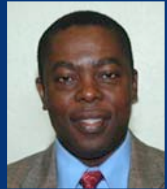
VSO Fitzroy Grizzle